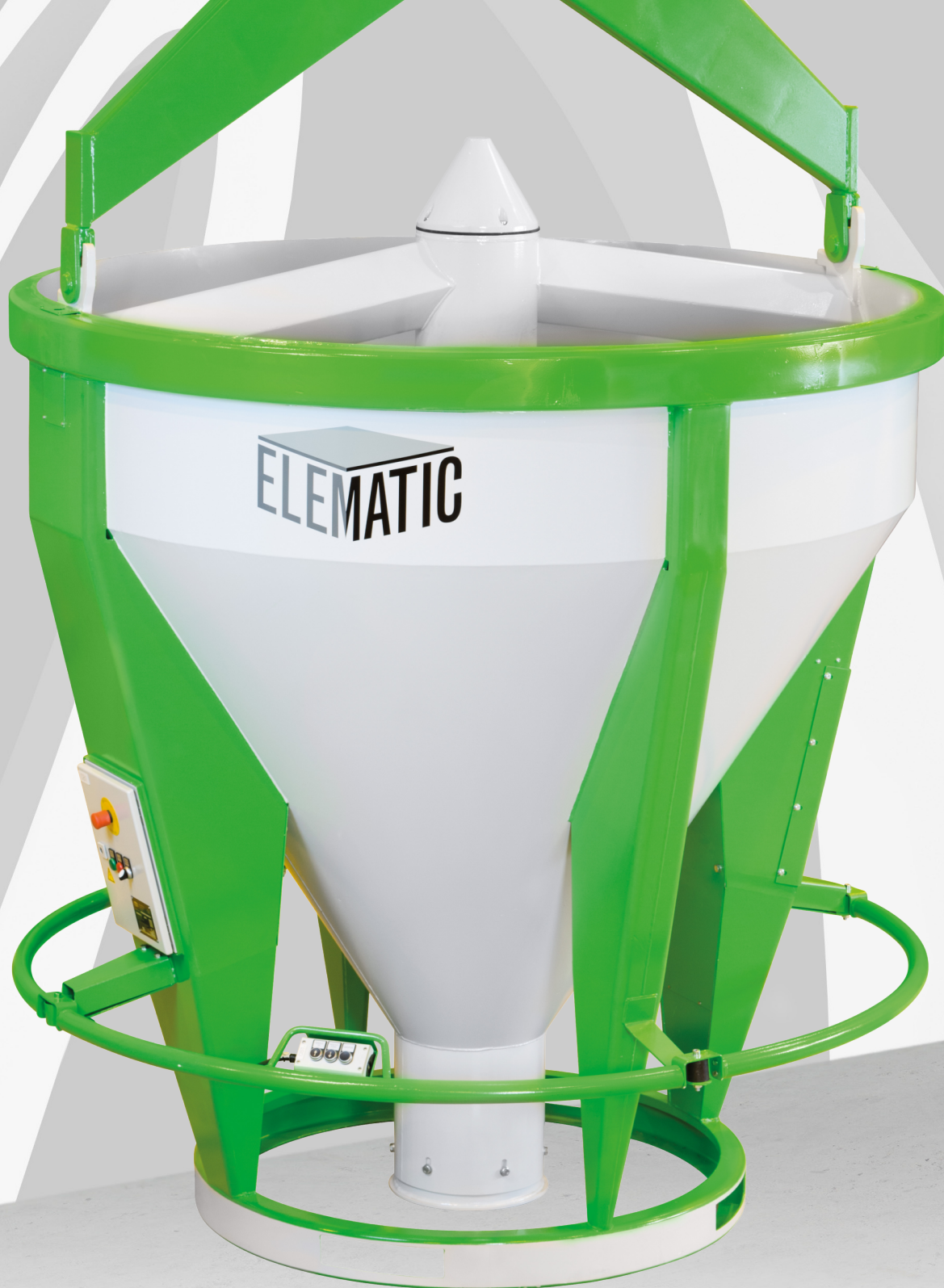
Comskip S5 -3000