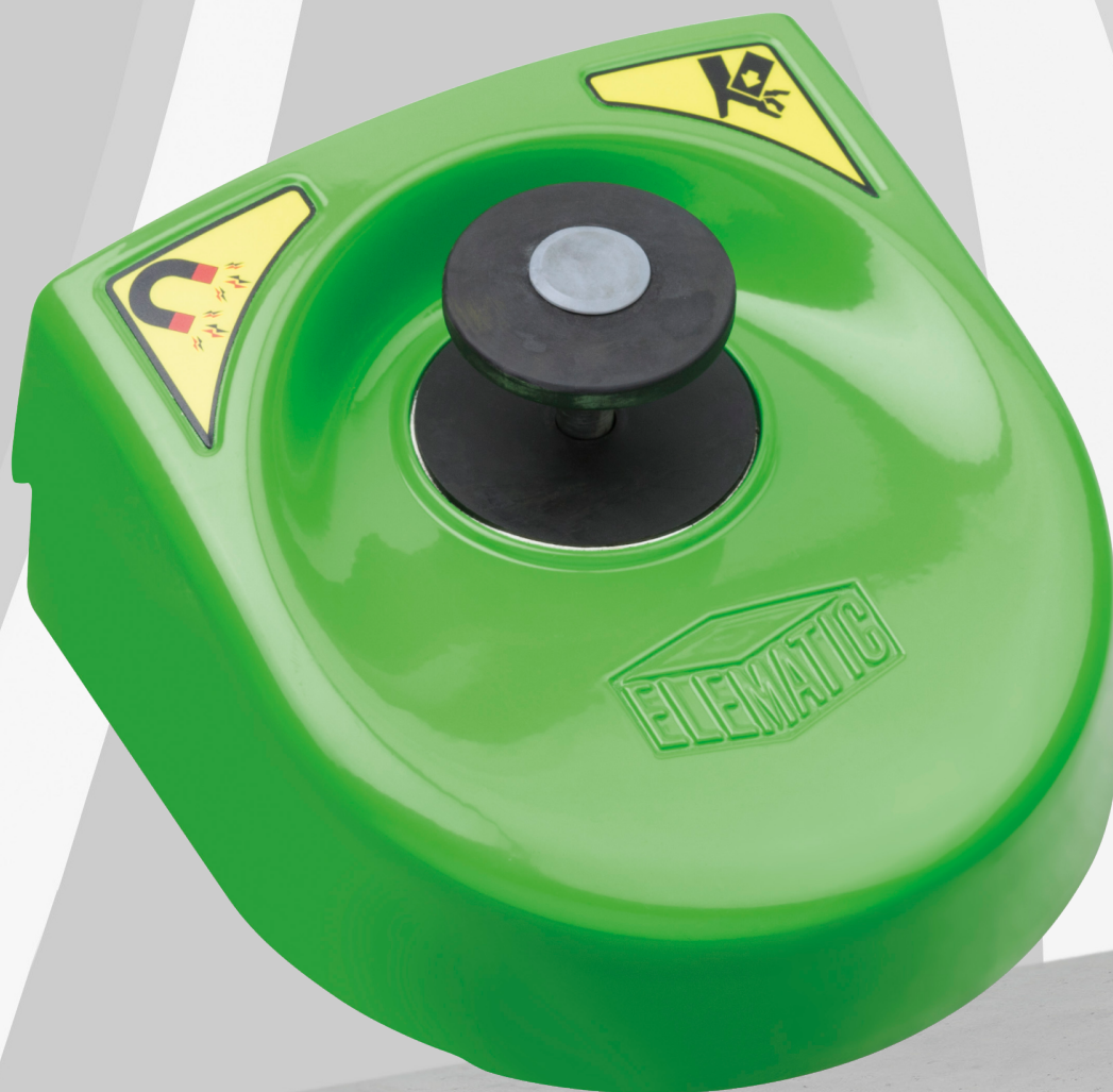
FaMe Push-Button Magnet